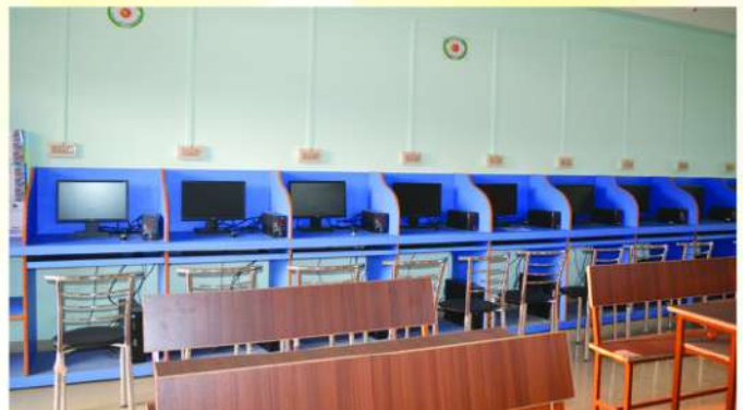
A view of Geographical Information System (GIS) Laboratory