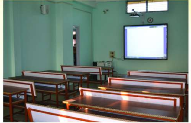
Smart Class Room