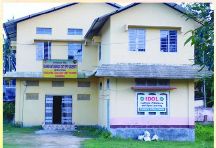
K.K.H.S.O.U. and IDOL- the two ODL study centres of college are housed in the same building