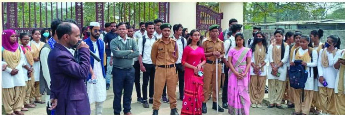
Street play on POSHAN Abhiyan