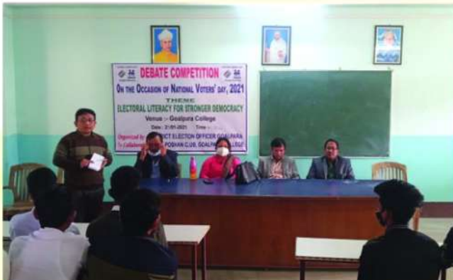
Celebration of National Voters' Day