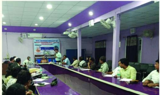
NAAC workshop organised by IQAC