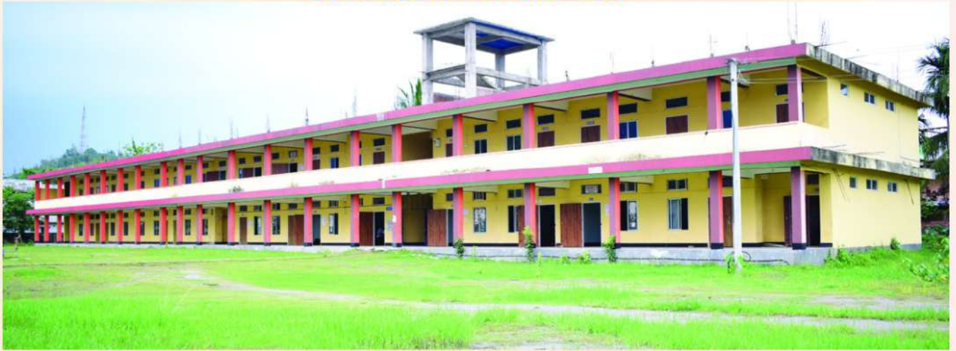
New Academic Building