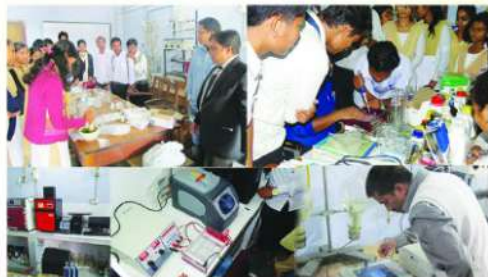
Department of Biotechnology (DBT) Govt. of India Sponsored Bio-Tech Hub

Goalpara College, Goalpara launched a Biotech Hub Centre at Department of Botany with financial grant provided by Department of Biotechnology (DBT), Government of India in 2010 and has completed six successful years. The main aim of this scheme is to provide modern facilities to the undergraduate students especially in the field of Molecular Biology along with upgraded laboratories. Apart from upgrading the existing labs we have a full-fledged Molecular Biology lab with uninterrupted power supply. Under Biotech Hub scheme, we organize various programmes every year e.g. three-day-seminar, workshop, industrial visits, field excursions for students. We have published a number of research papers. A practical manual entitled Practica manual in Biological Sciences has been published for the students. We encourage students from all disciplines to avail the facilities of this scheme to carry on their research projects.