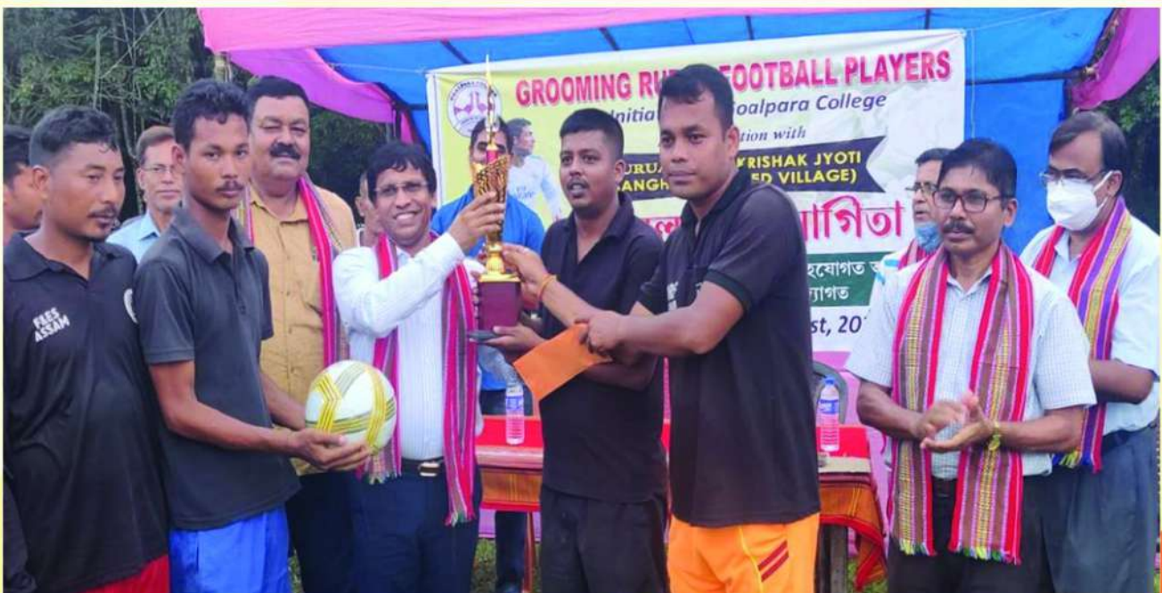
Grooming Rural Footballers in the adopted village Kuruabhasa