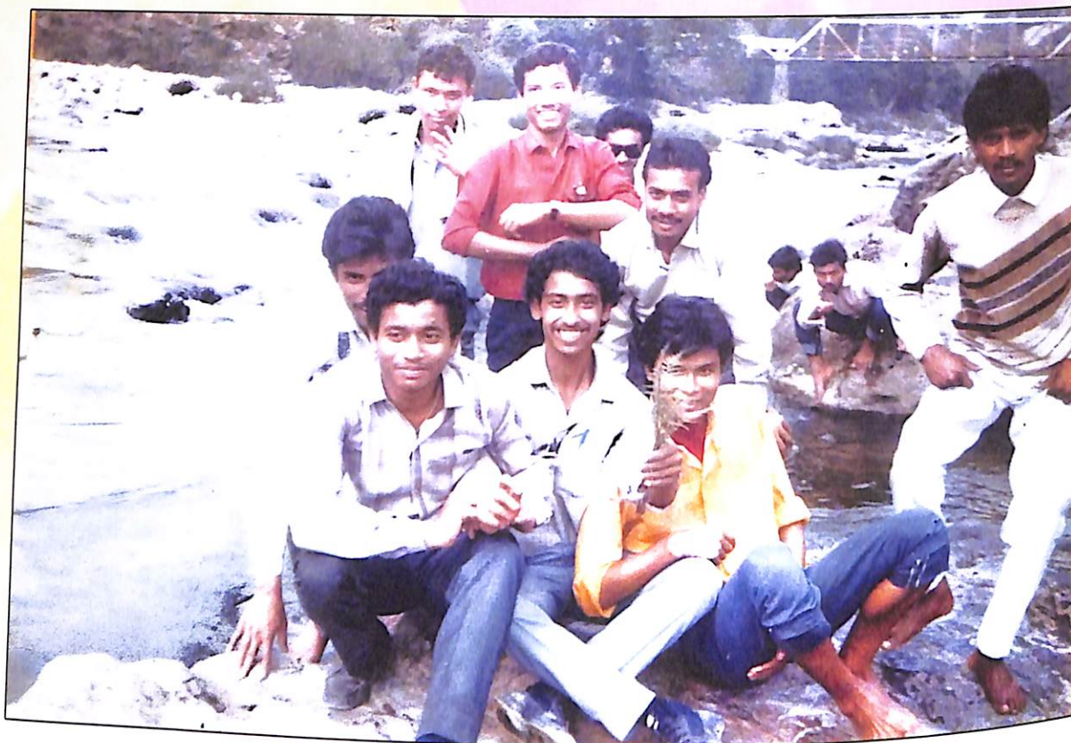
Excursion photo of Nagaland and Meghalaya during the year 1993